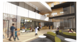
Online Mechanical Services O&M Manual | Dubbo Base Hospital Redevelopment Stage 4