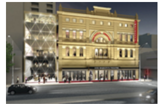
Electrical Services O&M Manual | Her Majesty's Theatre Renewal Project