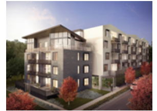
Builder's Manual and Apartment User Guides | Kelso Apartments