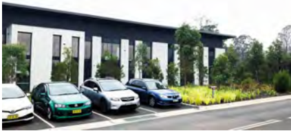
Sydney Metro OCC Expansion and Fit-out Works, Rouse Hill NSW