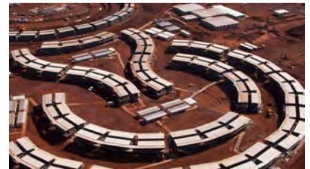
Koodaideri Main Village and Kitchen Store, WA